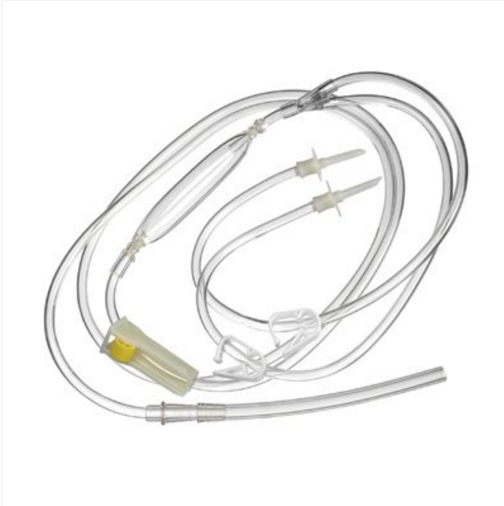
Ecospike No. 2

Twin line irrigation set for intra- and postoperative urological irrigation.