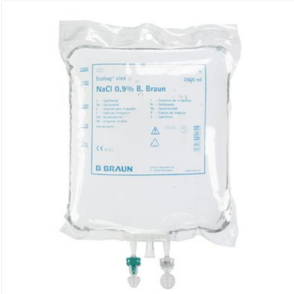
NaCL 0.9 B. Braun