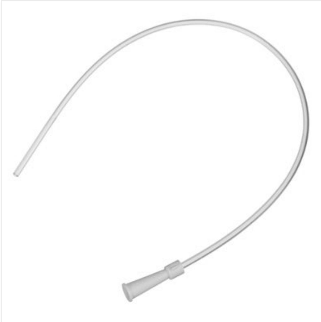
Suction Cathetr Standard