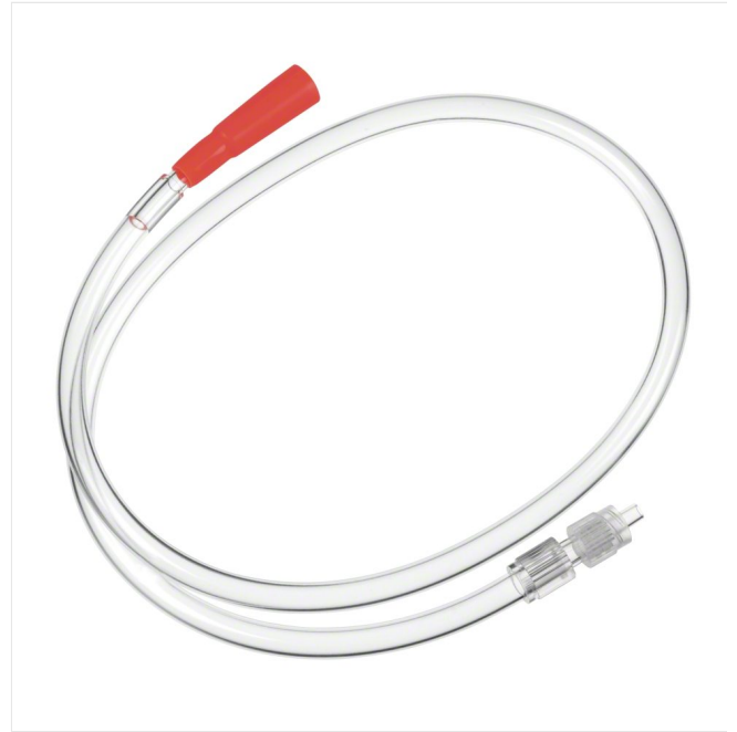
Fitting set Luer-Lock

The adapter fits to standard silicone tubing sets of Ecospike and Ecoclick® sets and provides a Luer-Lock connection to the surgical instrument.