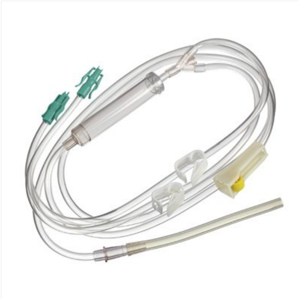
Ecoclick No. 2

Twin line irrigation set for intra- and postoperative irrigation of the bladder with Ecobag® click.