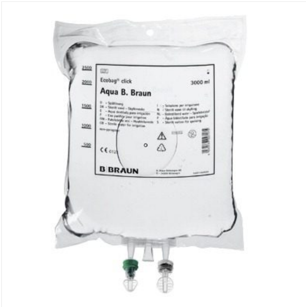
Aqua B. Braun in Ecobag