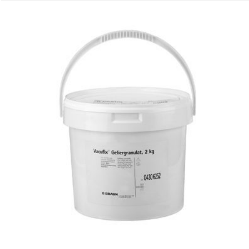
Vacufix® Gelling Granulate 2 kg

Absorbs suctioned fluids prior to disposal of the Vacufix® collection bag