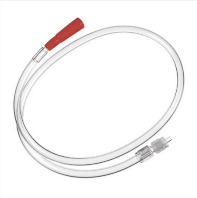
Fitting set Luer Lock