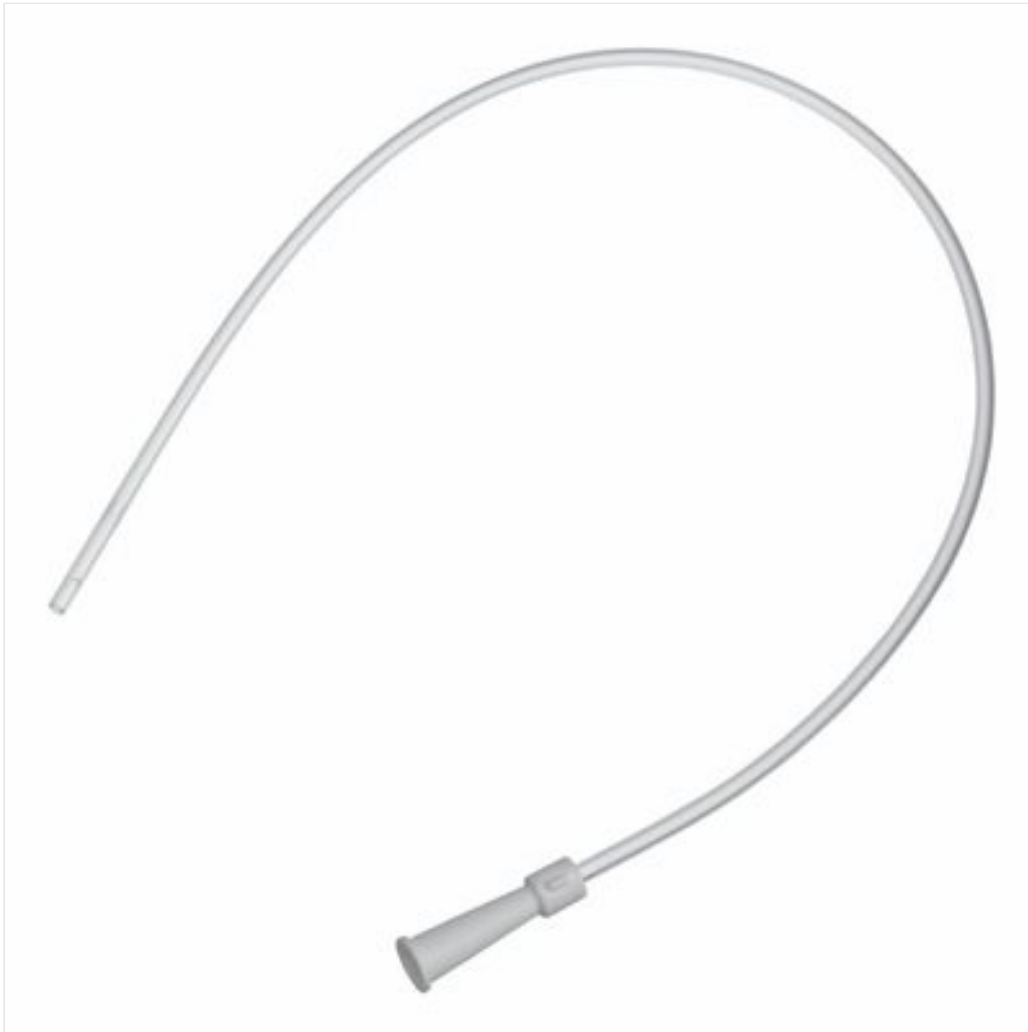
Ideal Suction Catheter

Flexible, long tube to remove respiratory secretions from the airway