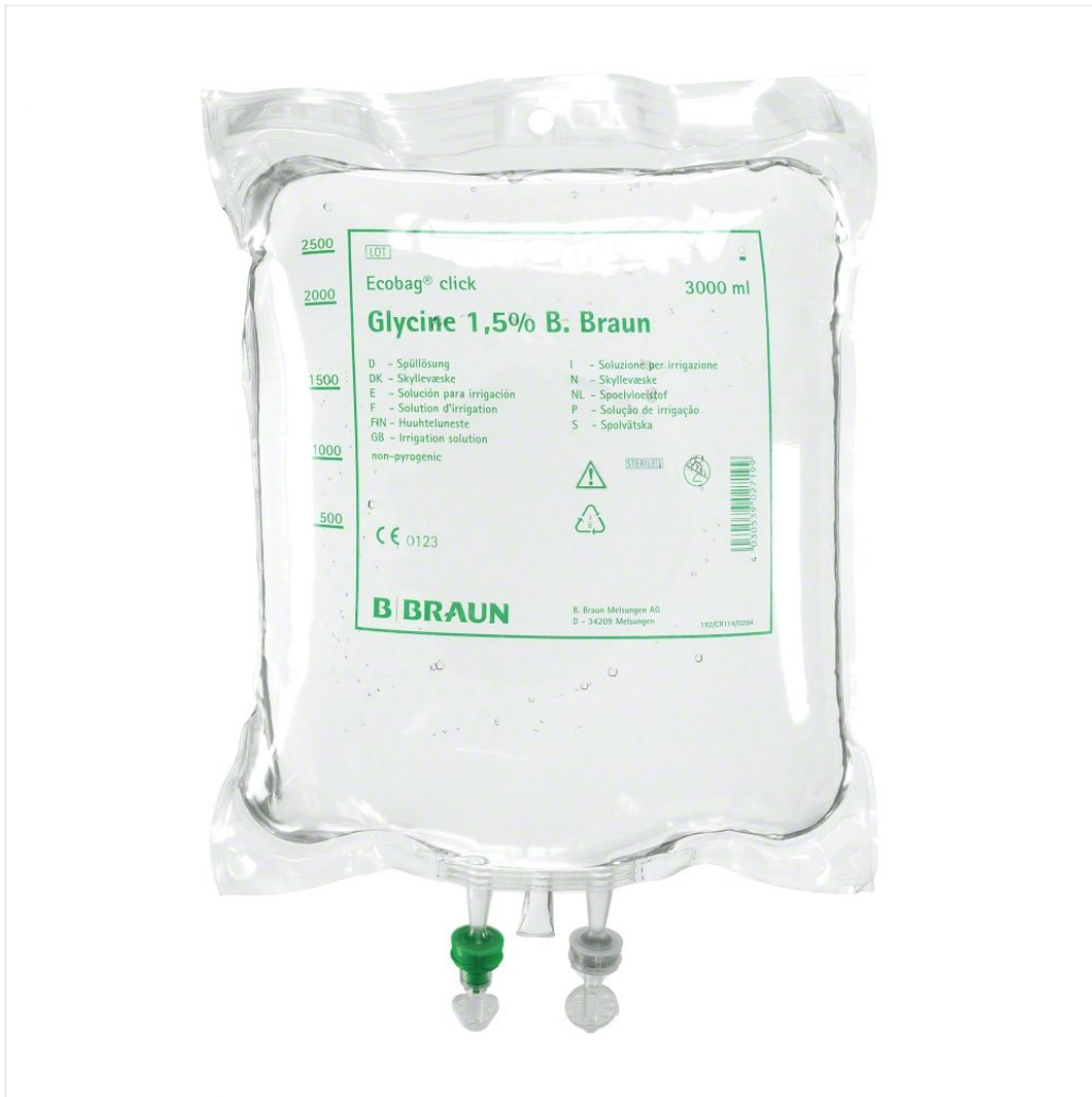
Glycine 1,5% B. Braun