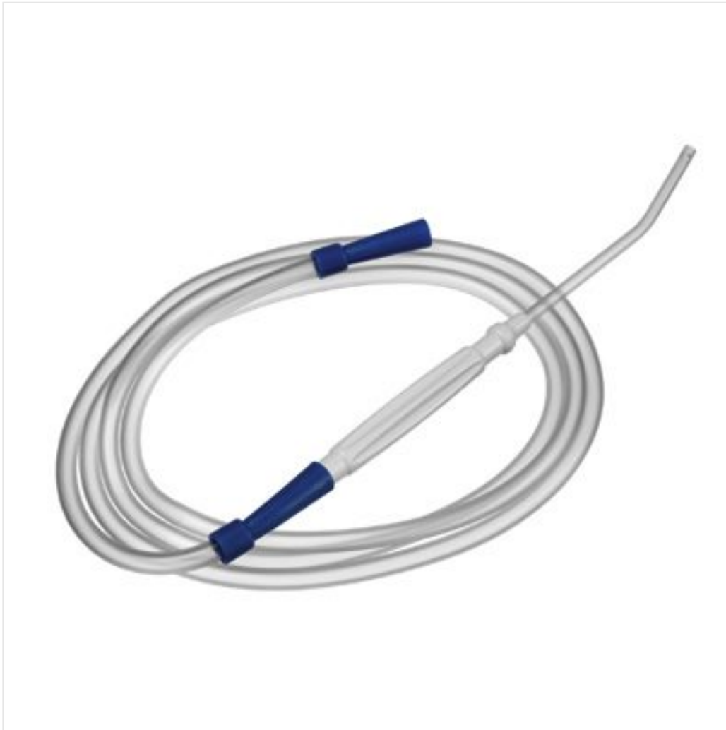
Vacufix® Suction Sets

Vacufix® Suction set consisting of: Handle and tubing