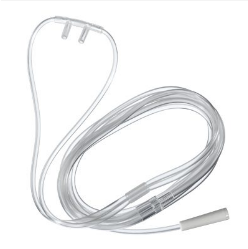
Oxygen Insufflation Set