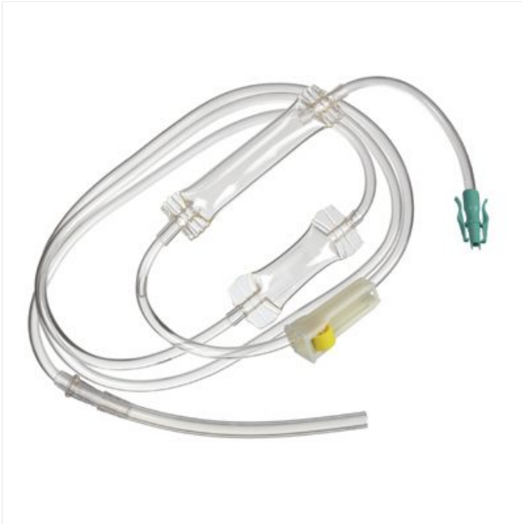
Ecoclick No. 4

Single line irrigation set with non return valve for intra- and postoperative urological irrigation with Ecobag® click