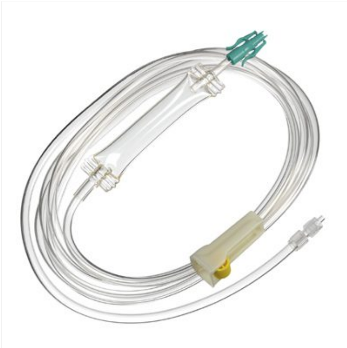
Ecoclick - Arthros No. 2

Single line irrigation set for arthroscopical use with Ecobag® click