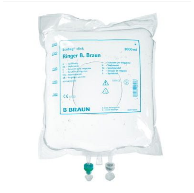
Ringer B. Braun Irrigation Solution