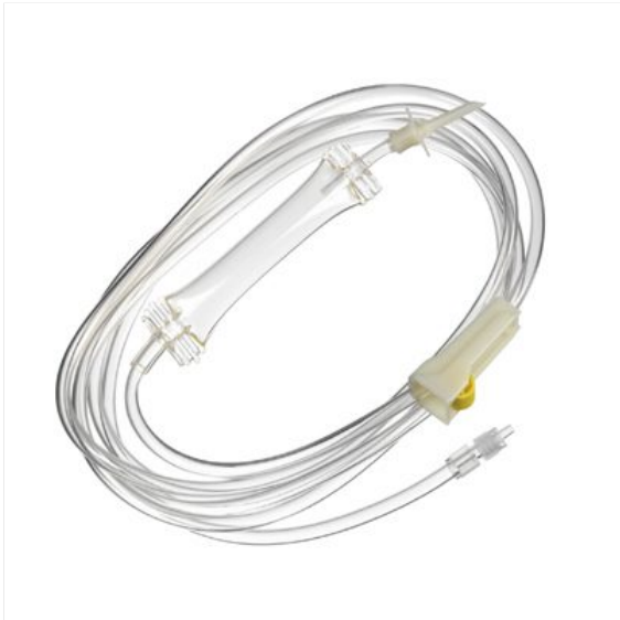
Ecospike-Arthros No. 2

Single line irrigation set for arthroscopical use.