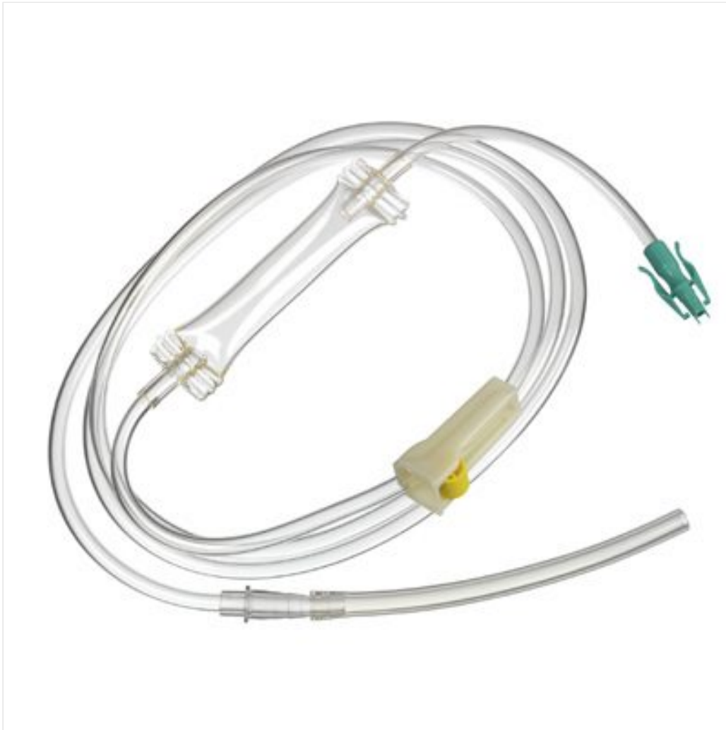
Ecoclick No. 1

Single line irrigation set for intra- and postoperative irrigation of the bladder with Ecobag® click.