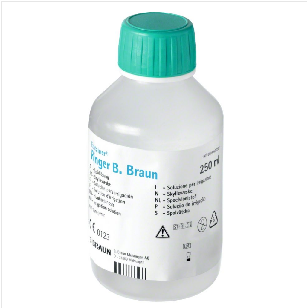
Ringer B. Braun