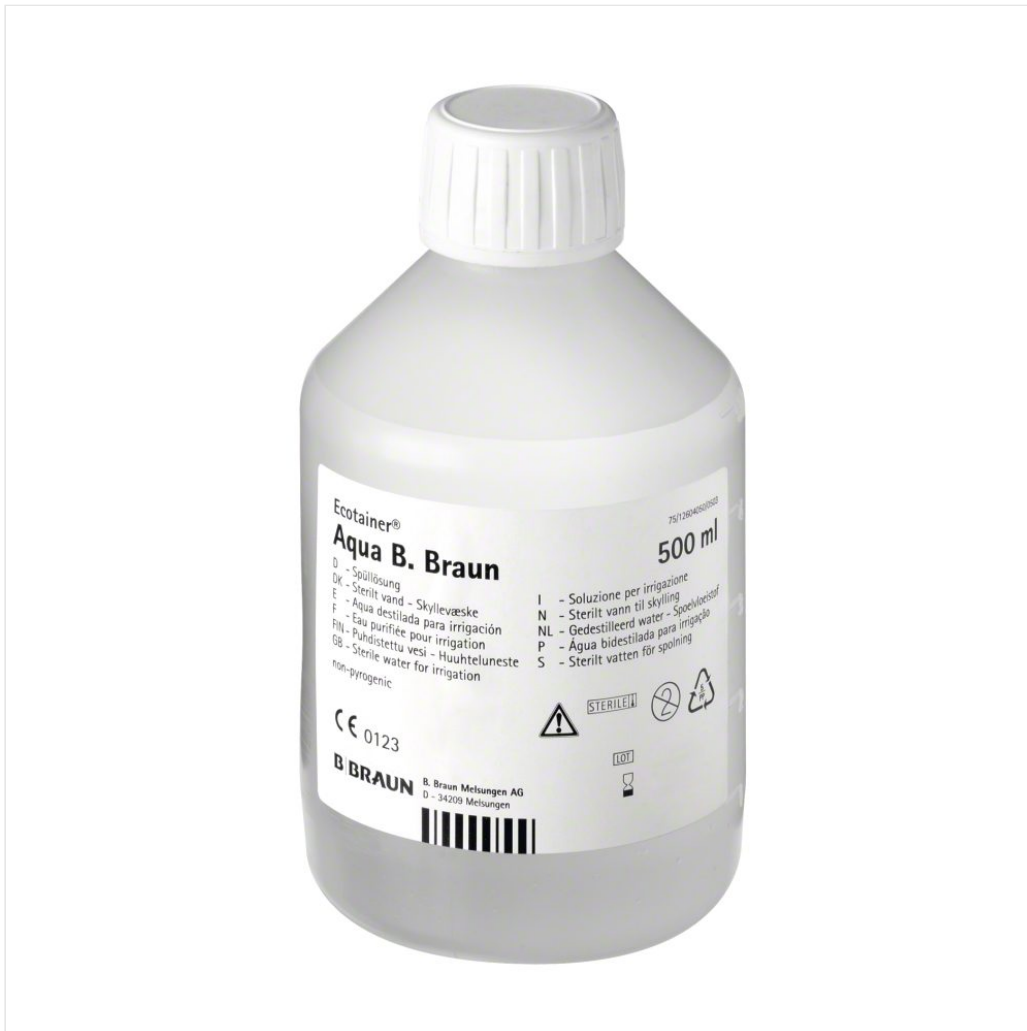
Aqua B. Braun