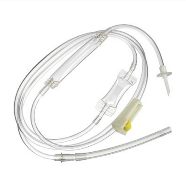
Ecospike No. 4

Single line irrigation set with non return valve for intra- and postoperative urological irrigation.