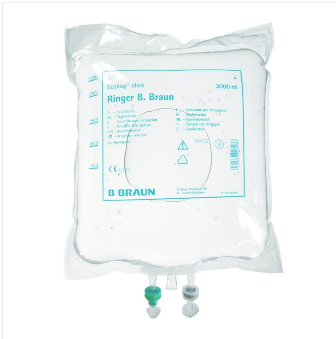
Ringer B. Braun