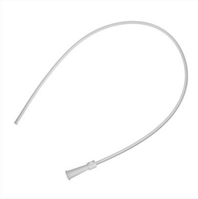
Invasoft Suction Catheter

Straight suction catheter with air-vent tip, central opening, 2 lateral eyes