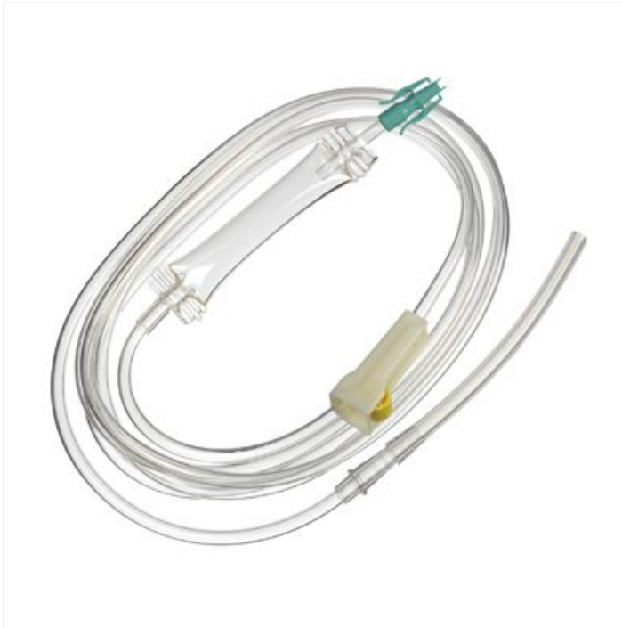
Ecoclick - Arthros No. 1

Single line irrigation set for arthroscopical use with Ecobag® click